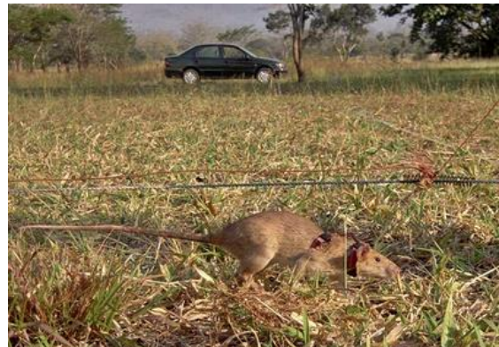
Racing the car to find the landmines!

When I last checked-in with you, I was beginning the last and most difficult stage of my training to become a full-fledged HeroRAT: the advanced stage. At this stage, I must cover a 5x20 meter box everyday! In these boxes, there are zero to four landmines so I never know how many or where they will be. The grass is also longer and closer to how the terrain will be in a real landmine fields.