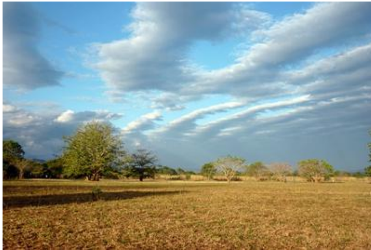
Our landmine training field. Can you see the landmines buried under the soil?