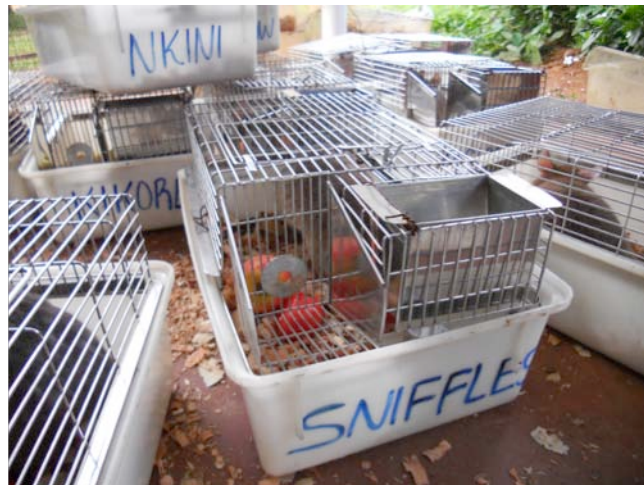
The Sniffles express: this is my transport cage, complete with a bed of peanuts and tomato treats to keep me hydrated during the journey. Time to fly!

Right now the other rookies and I are getting some rest and relaxation as we acclimatize to our new home. There's a lot to take in! For one thing, the dirt smells (and feels) different, and we have to adjust to new, distracting scents. For another thing, it's quite hot here – even hotter than Tanzania!