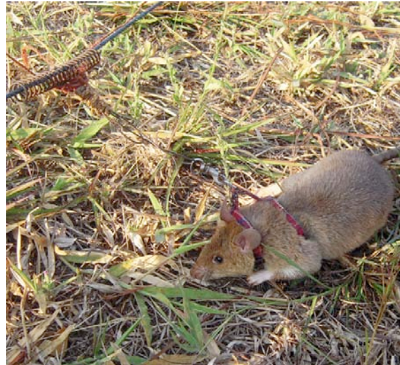
Doing what I do best...sniffing out landmines at our training field!

The HeroRAT training program (which I am in the middle of!) is constantly being refined to get us Hero-ready even faster at our Center of Excellence in Tanzania. In total, we have 195 rats in various stages of landmine detection training or accreditation procedures.