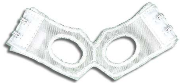
Small Rat Jackets (150-250g)

One of the keys to success for any animal species in jackets is wherever possible acclimating the animals to the jacket before commencing the procedure. You will always have a small percentage of animals that will not tolerate a jacket (3- 5% of rat in any given group will not accept the jacket). Keep in mind that some strain of rat are naturally more aggressive than the Sprague Dawley and may therefore be less tolerant of the jackets.