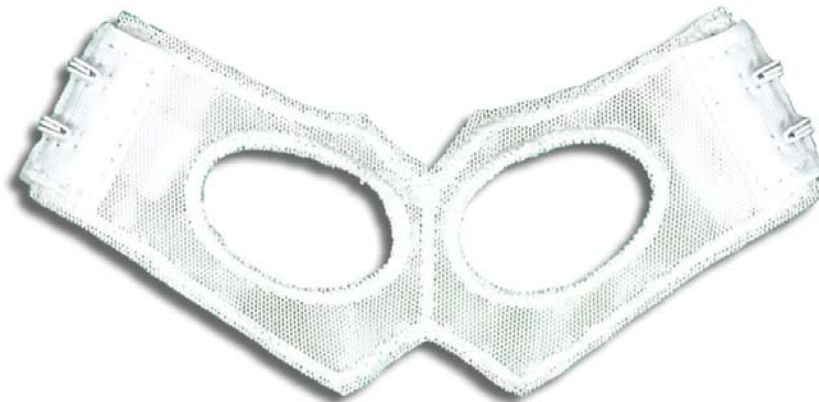
Medium Rat Jackets (250-350g)

The most common comment that we get from customers concerning setting up rats in jackets is that they escape, more often as not this is because the jacket has not been fastened tight enough. To ensure a proper fit the jacket needs to be tight enough that you can just get the sharp end of a pencil under the jacket. Additionally, ensure that the correct size jacket for the animal’s weight range is being used.