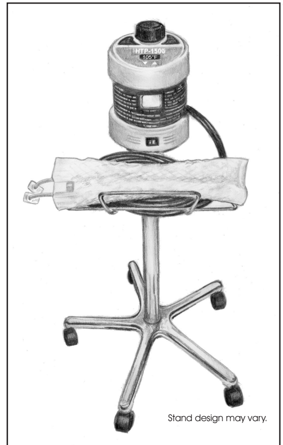
Stand design may vary.