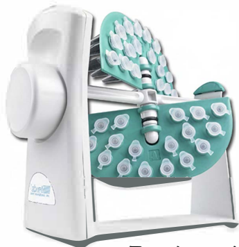
Revolver with Standard Rotisserie

With a molded housing and unique rotisserie design, the Revolver is easy to clean and decontaminate. A 36 x 1.5/2.0 ml rotisserie is supplied with the Revolver. Other configurations are available separately.