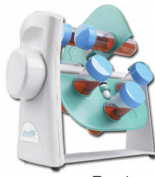
Revolver with H5600-50 Rotisserie