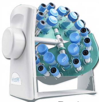
Revolver with H5600-15 Rotisserie