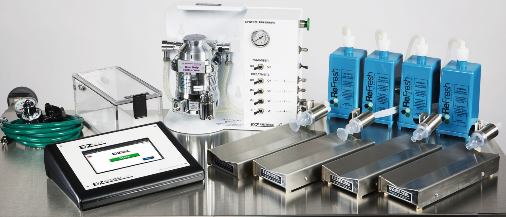
EZ-AF9000 - shown with E-Z Heat Controller and Heated Surgery Beds