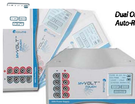
Dual Orientation, Auto-Rotating Display

Dual Orientation, Auto-Rotating Display: The myVolt Touch packs plenty of power and features into a compact housing. But for those crowded lab benches, we've taken our design a step further. The myVolt can be configured horizontally or vertically to fit the space available either on a lab bench or a shelf. In either position, the display automatically rotates to the correct orientation. Folding feet can be extended when the power supply is horizontal for convenient access and viewing of the touch screen. When set vertically, the touchscreen is tilted up toward the user.