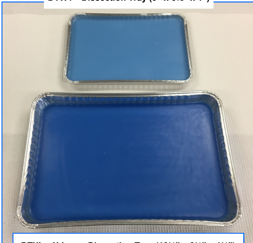
DTXL—X-Large Dissection Tray (12¼” x 8¼” x 1¼”)

“Blue Wax” dissection trays uses a completely environmentally safe wax product. Unlike the “Black Wax” most commonly used in other dissection trays. “Black Wax” dissection trays commonly list toxic chemicals and fire, health & reactivity hazards.