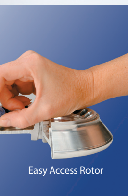
Easy Access Rotor

The Prism Microcentrifuge offers a maximum speed of 15,000 rpm / 21,200 x g for very efficient separation of nucleic acids and protein samples. Quick acceleration and deceleration reduce processing time, and our unique "multi-flow" air cooling system keeps the rotor and samples close to ambient temperature with minimal noise.