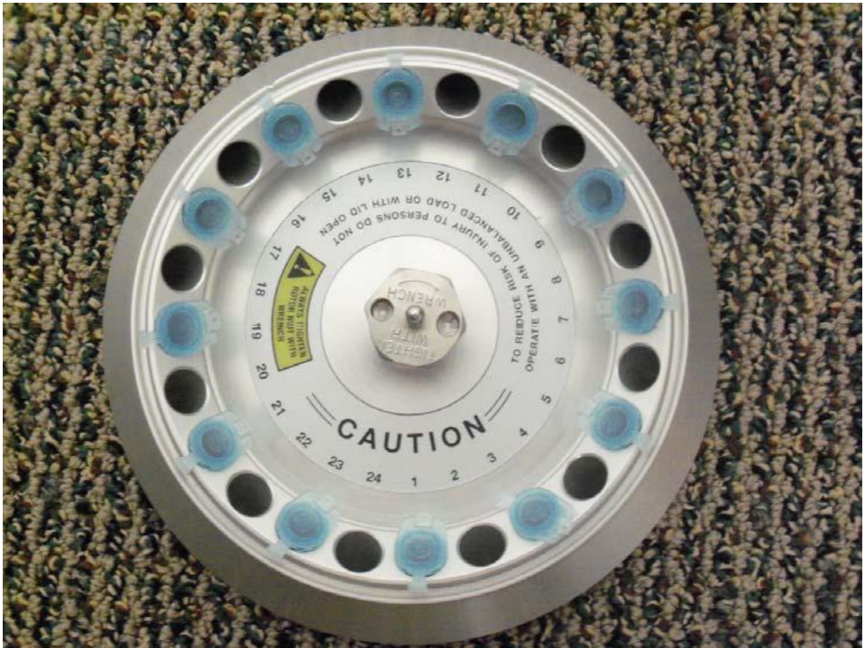
Figure 1. Loading the rotor to achieve balance

To replace rotor, first make sure the motor shaft and rotor mounting hole are clean. Place the rotor on the motor shaft. Reinstall the rotor securing screw on the motor shaft by turning it clockwise. Hold the rotor with one hand and tighten the rotor securing screw, using the rotor wrench.