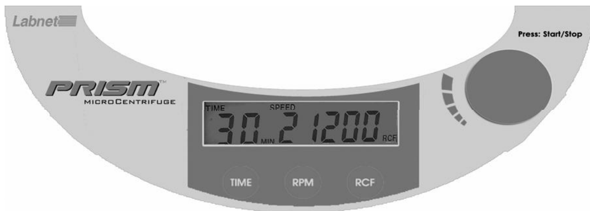
Figure 2. Prism Microcentrifuge control panel layout

Operating time can be selected from 0.5 min to 99 min by pressing the TIME button and adjusting with the control knob. The time can be set in 0.5 minute increments from 0 to 10 minutes and in 1 minute increments from 10 to 99 minutes. After 99 minutes, the display shows "--" which indicates continuous run. In this mode, the centrifuge will run until manually stopped. To start a run, press the control knob. When the preselected time expires, the centrifuge will stop automatically. To stop the centrifuge prior to the expiration of set time, press the control knob. The centrifuge may be operated for a short run by pressing and holding the control knob. The centrifuge will continue to run as long as the control knob is depressed and the time, in seconds will count up on the time display.