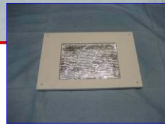
Space-Age Thermal Reflector Maximizes Heat Transfer

Bottom holds two space gels for over 2 hours of Thermo-Regulation.