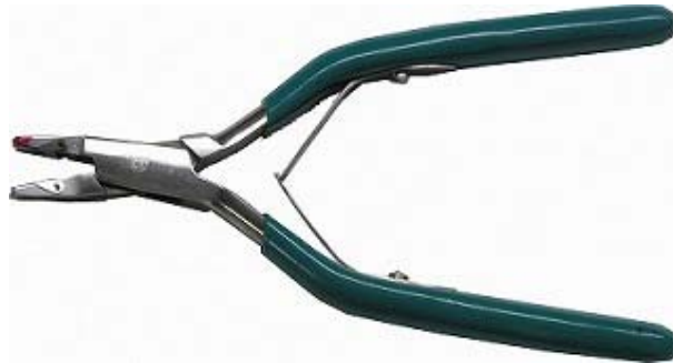
Figure 6 Ear Tag Applicator

Your Distributor is: Braintree Scientific, Inc. PO Box 850498, Braintree, MA 02185 781-917-9526 Email: Info@braintreesci.com Web: www.braintreesci.com